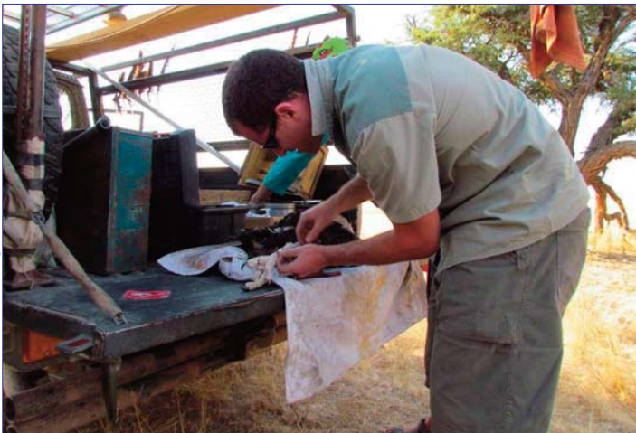
Cronje Grane ringing in the Namib-Naukluft Park

A vulture boards an airplane, carrying two dead raccoons. The stewardess looks at him and says, 'I'm sorry, sir, only one carrion allowed per passenger.' Unknown